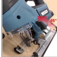
45° Left and Right Adjustable