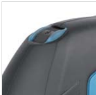
Electric Speed Adjustment