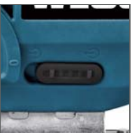
Dust Blower Switch With connection for external dust extraction